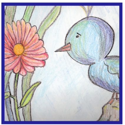
1. The season when flowers bloom?