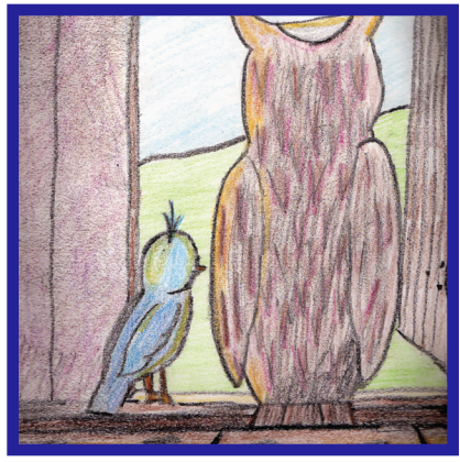
2. The season when friends rest in the shade?